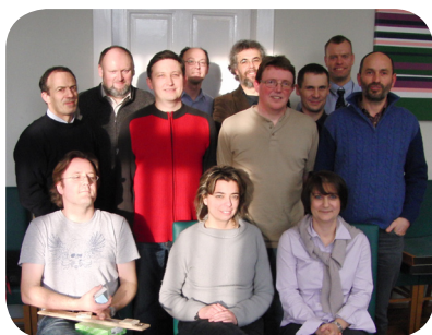
Project meeting in Brno, Czech Republic.