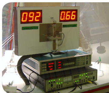
Measuring the critical temperature and resistance of a superconductor in Graz, Austria.